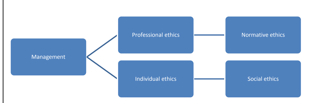
Figure 1: Management and ethics relation Model.

Figure 1 describes the connection between the management ethics and organization, for sustainability code of conduct is essential to set the values for the organization and helps the business management to take the workers get along with organizational goals .It's been seen and discussed in many articles that it is hard to have appropriate approaches for the ethics however, there is certain manner which can guide professionals or researchers to build a competitive environment. Ethics have a huge influence on management in a best way. Empirical studies say that ethical leadership is scarce. There are very few researches have been done on this topic; what factor develops or maintains the ethical leadership in organization and do ethics bring conceivability in business? Societal culture in form of institutional collectivism, performance orientation, or uncertainty avoidance can provide the contextual cues that shape people beliefs about the importance of ethical leadership for understanding leadership.