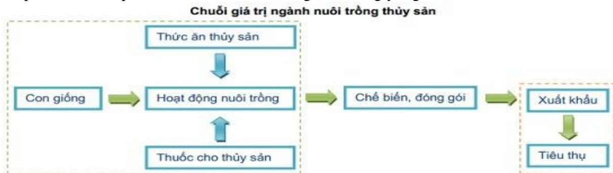
Fig.2: Value chain of the aquaculture industry

Together with fishery, aquaculture provides inputs for seafood processing, seafood consumption, and export. Currently, with the growing demand of the market, while the fishery is slowing down, the requirements for the development of the aquaculture sector is becoming increasingly urgent.