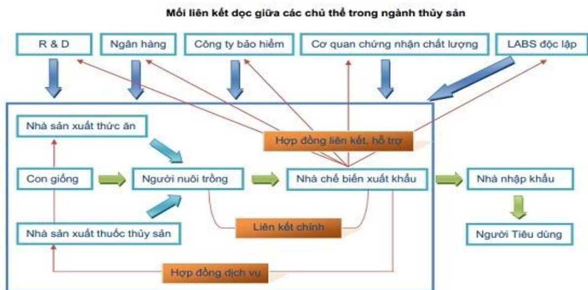
Fig.4: Linkages between entities in the fisheries sector